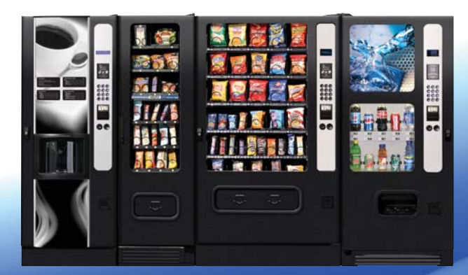
Full Line Vending Products & Services

Dispense a wide variety of foods & beverages.